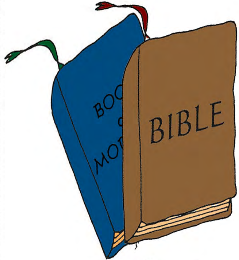
Book of Mormon (and Bible)