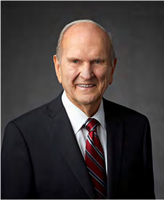
President Russell M. Nelson